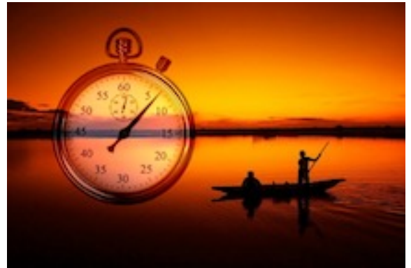
Figure 4. I followed one of Akvis' tutorials to create this image using the Blend Mode.

The Home and Home Deluxe versions are for non-commercial personal use whereas the Business version is for people/business who want to sell their final artwork. The Home Deluxe and Business versions have a few extra tools than the Home version. I suggest that you go to Akvis' Comparison web page to see the exact difference between the different versions.