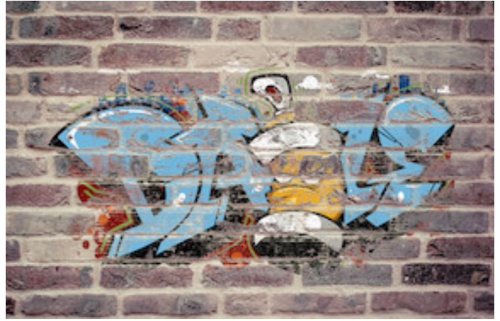
Figure 3. The Emersion Mode embeds image #1 into the background (image #2) so that only certain parts of image #1 are visible. I used this to show a piece of graffiti art that is in two stages of slowly weathering away.

chameleon adapts to its surroundings (Figure 2).